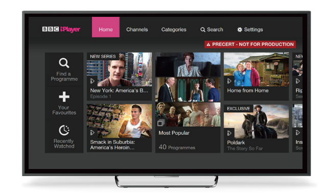
Figure 2. BBC iPlayer powered by Sraf HTML5 Browser Copyright BBC iPlayer content: BBC

The multi-million pound campaign promoting a one-stop hub of popular broadcast and OD content is expected to drive significant customer interest in FVP products.